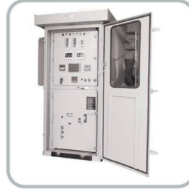
Outdoor KIOSK VCB