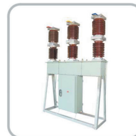
Porcelain Clad VCB