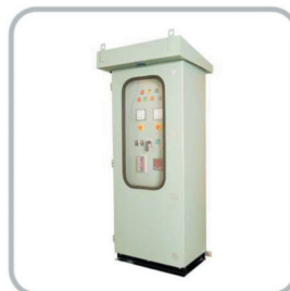
Control & Relay Panel