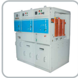
Ring Main Units