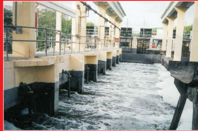
Water & Waste Water Treatment